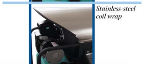
Stainless-steel coil wrap