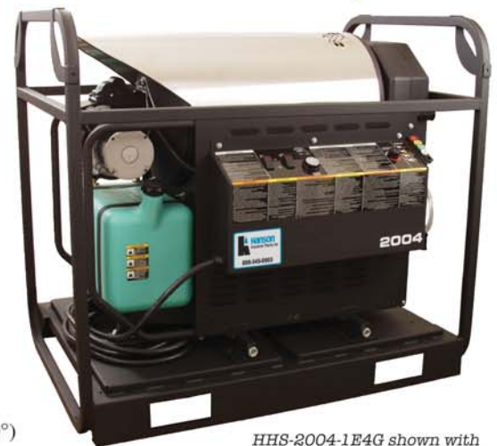
HHS-2004-1E4G shown with skid frame (HX-0196) option