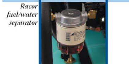
Racor fuel/water separator