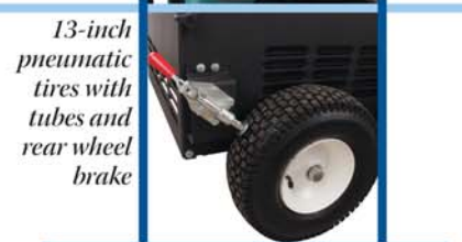
13-inch pneumatic tires with tubes and rear wheel brake