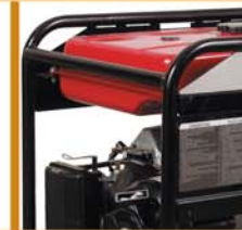
Heavy-duty wraparound frame with 1-inch powder coated steel tubing