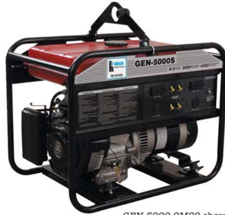
GEN-5000-0MSO shown with optional lifting hook (AW-5090-0003)