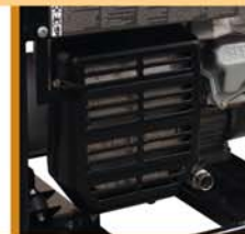
Large low-tone mufflers to reduce noise to lowest levels possible