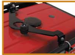
Lifting hook folds down and out of the way when not in use.