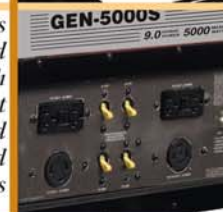
Easy-access and protected control panel with magnetic circuit breakers and GFCI-protected receptacles