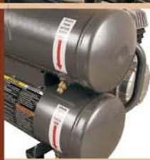
5-gallon powder coated tank assembly