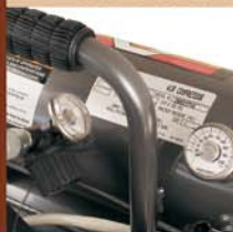
Regulator and two gauges for tank and outlet pressure