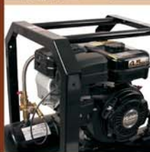
Roll cage design (gasoline models only)